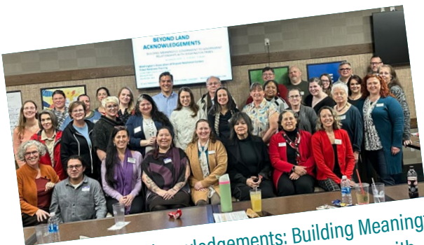
Beyond Land Acknowledgements: Building Meaningful Government to Government Relationships with Washington Tribes; Full Day Tribal Relations Training