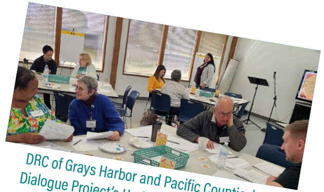
DRC of Grays Harbor and Pacific Counties' Dialogue Project's Harborside Chats Series